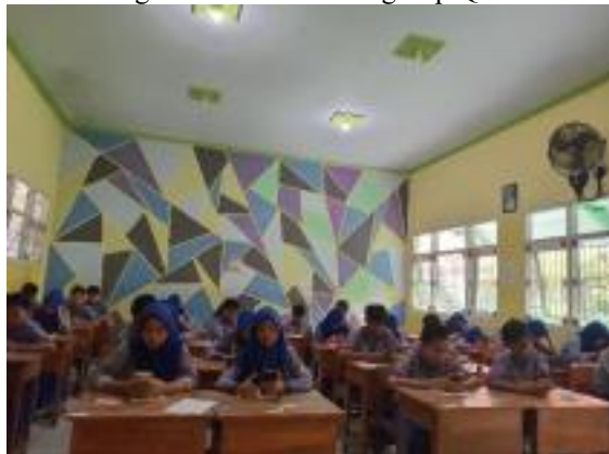
Figure 1. Students using Zep Quiz in learning