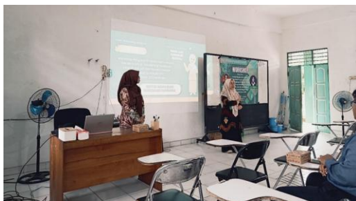
Figure 1. Documentation of Intensive Mentoring and Practice in Preparing Teaching Modules